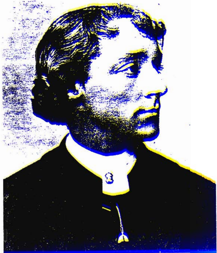
KYRLE BELLEW. ca. 1897.